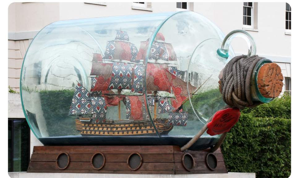
Nelson's Ship in a Bottle

Nelson's Ship in a Bottle (2010) by Yinka Shonibare was the first commission for Trafalgar Square by a black artist. It symbolises and celebrates the story of multiculturalism in London.