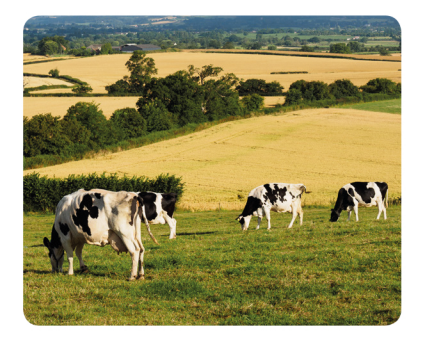
Mixed farming is both growing crops and rearing animals.

The type of farming depends on the climate, the quality of the soil and the topography of the area. For example, the flat, nutrient-rich land in the east of England is perfect for arable farming, whereas the wet and windy hills of central Wales are most suited to pastoral sheep farming.