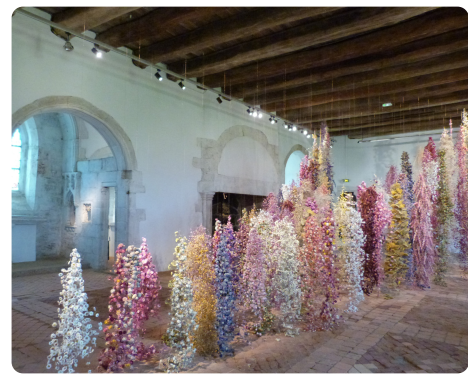
Banquet by Rebecca Louise Law, 2019

Some land artists bring materials inside from the outdoor environment to create installations in galleries and exhibition spaces.