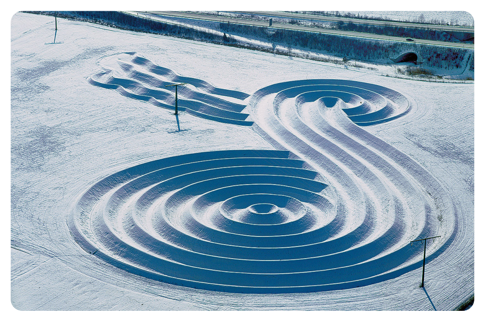
Earth Sign by Wilhelm Holderied, 1995

A relief sculpture projects from a flat surface. A high relief sculpture clearly projects out of the surface and looks like it is freestanding. A low relief, or bas-relief, sculpture does not project far out of the surface and is visibly attached to the background.