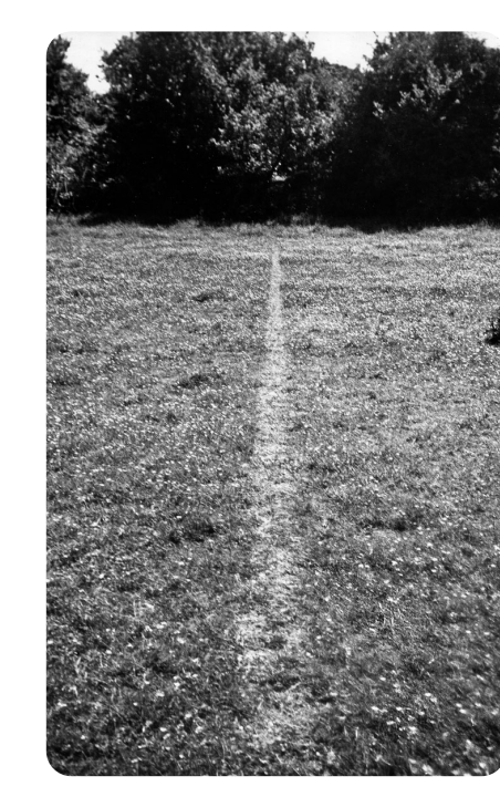
A Line Made by Walking by Richard Long, 1967

Land art can be made from many materials. Some artists sculpt the land into pieces called earthworks. Other artists use natural materials, such as twigs and rocks, to make sculptures within the landscape. Land art may be temporary, such as A Line Made by Walking. Richard Long made this line in the grass by repeatedly walking backwards and forwards.