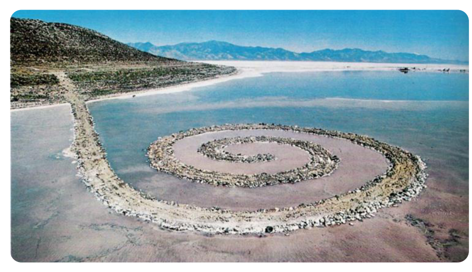
Spiral Jetty by Robert Smithson, 1970

Land art, or Earth art, is art that is made within the landscape. Land art is usually captured using photography because it is temporary and often made on a large scale.